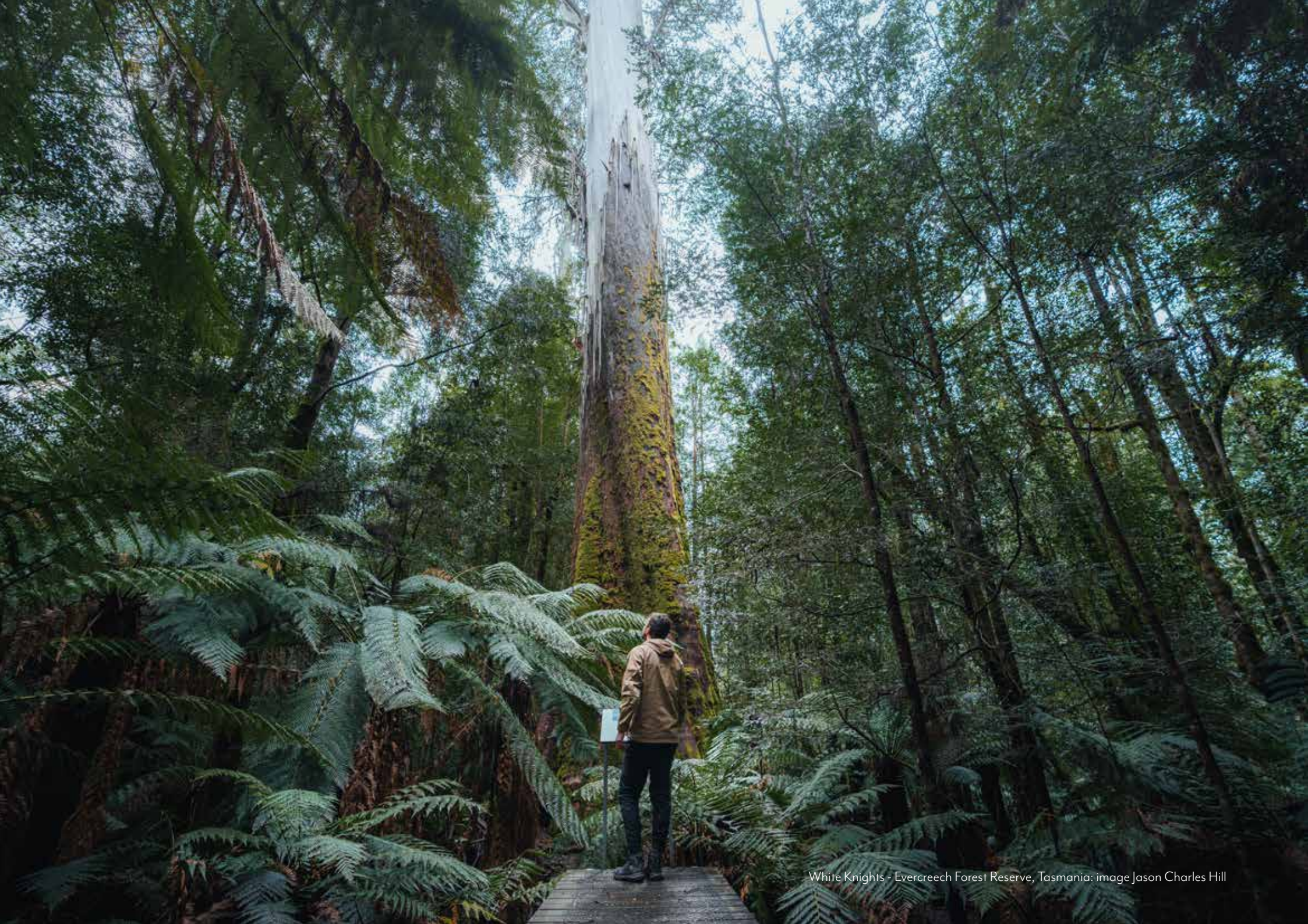
White Knights - Evercreech Forest Reserve, Tasmania