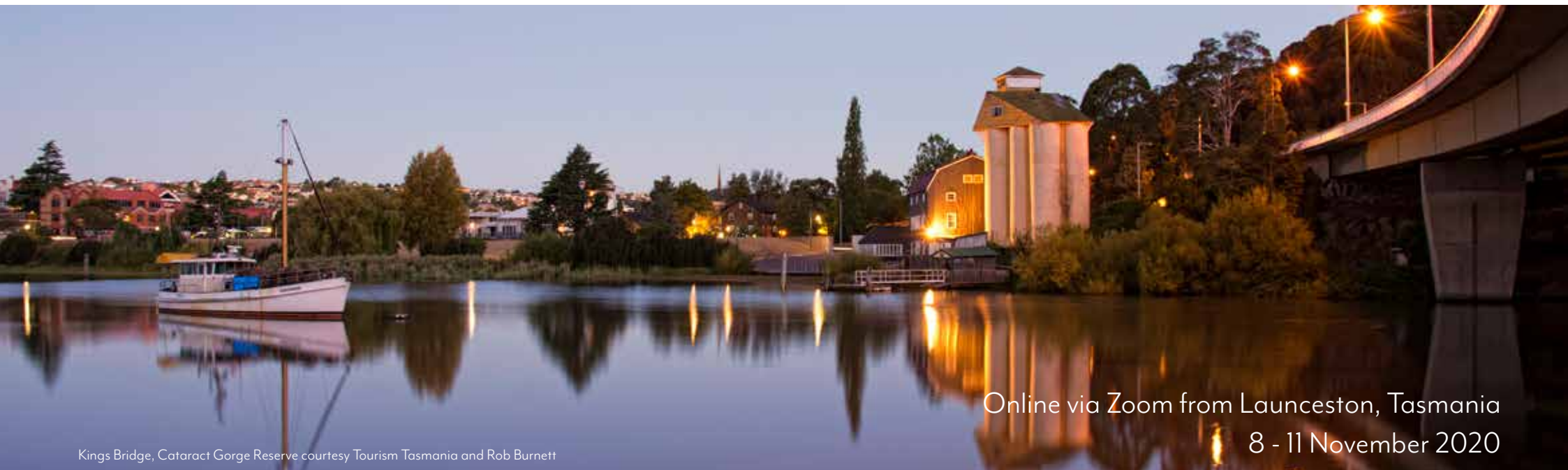
Kings Bridge, Cataract Gorge Reserve

Online via Zoom from Launceston, Tasmania 8 - 11 November 2020