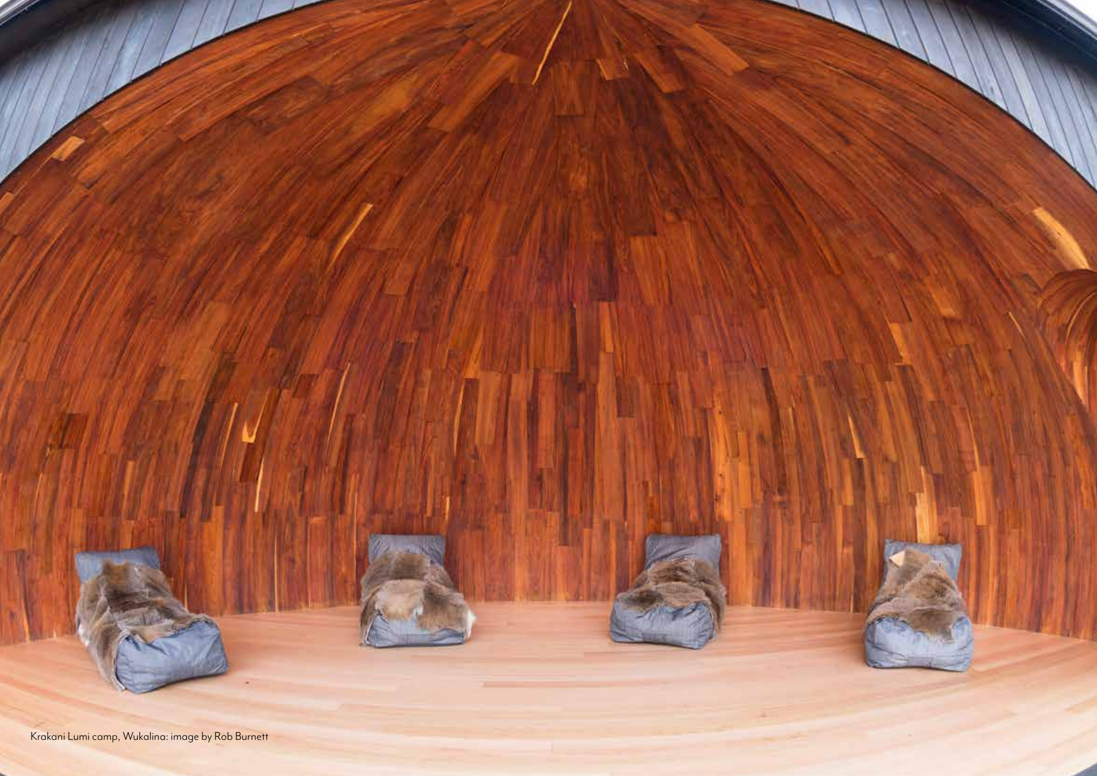
Krakani Lumi camp, Wukalina