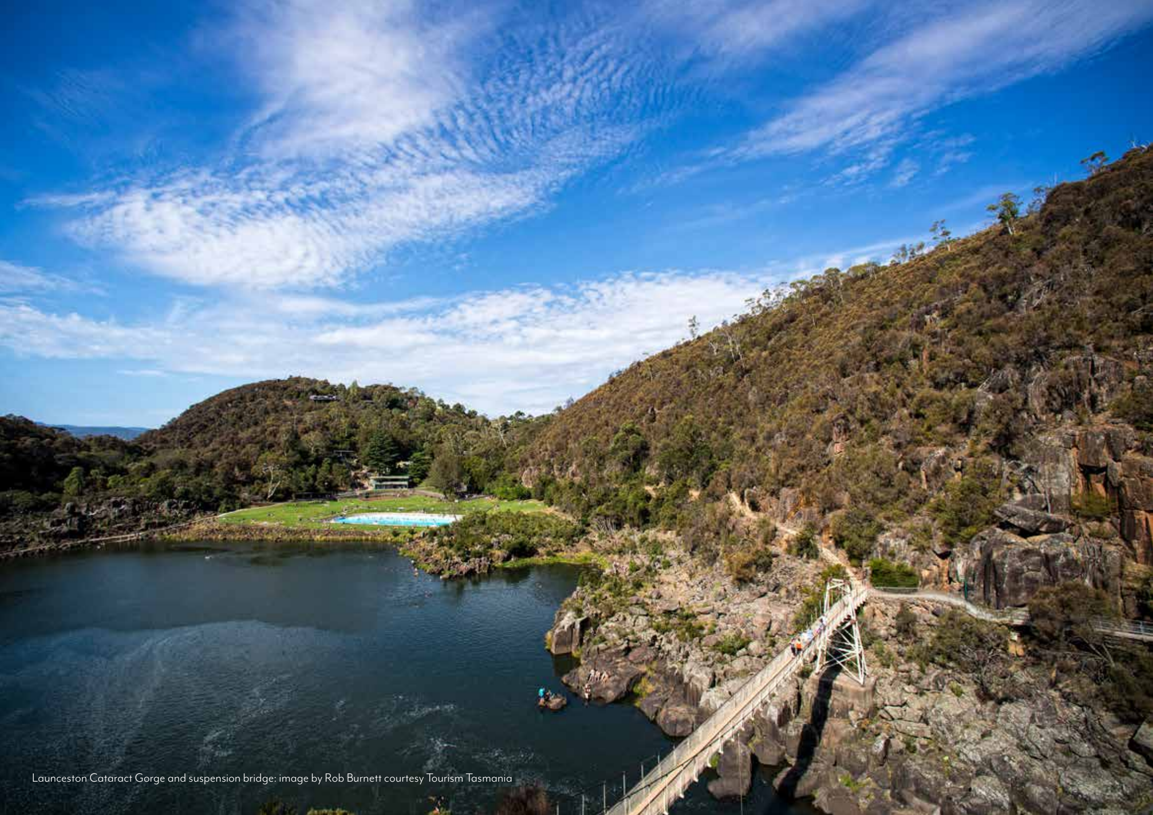
Launceston Cataract Gorge and suspension bridge