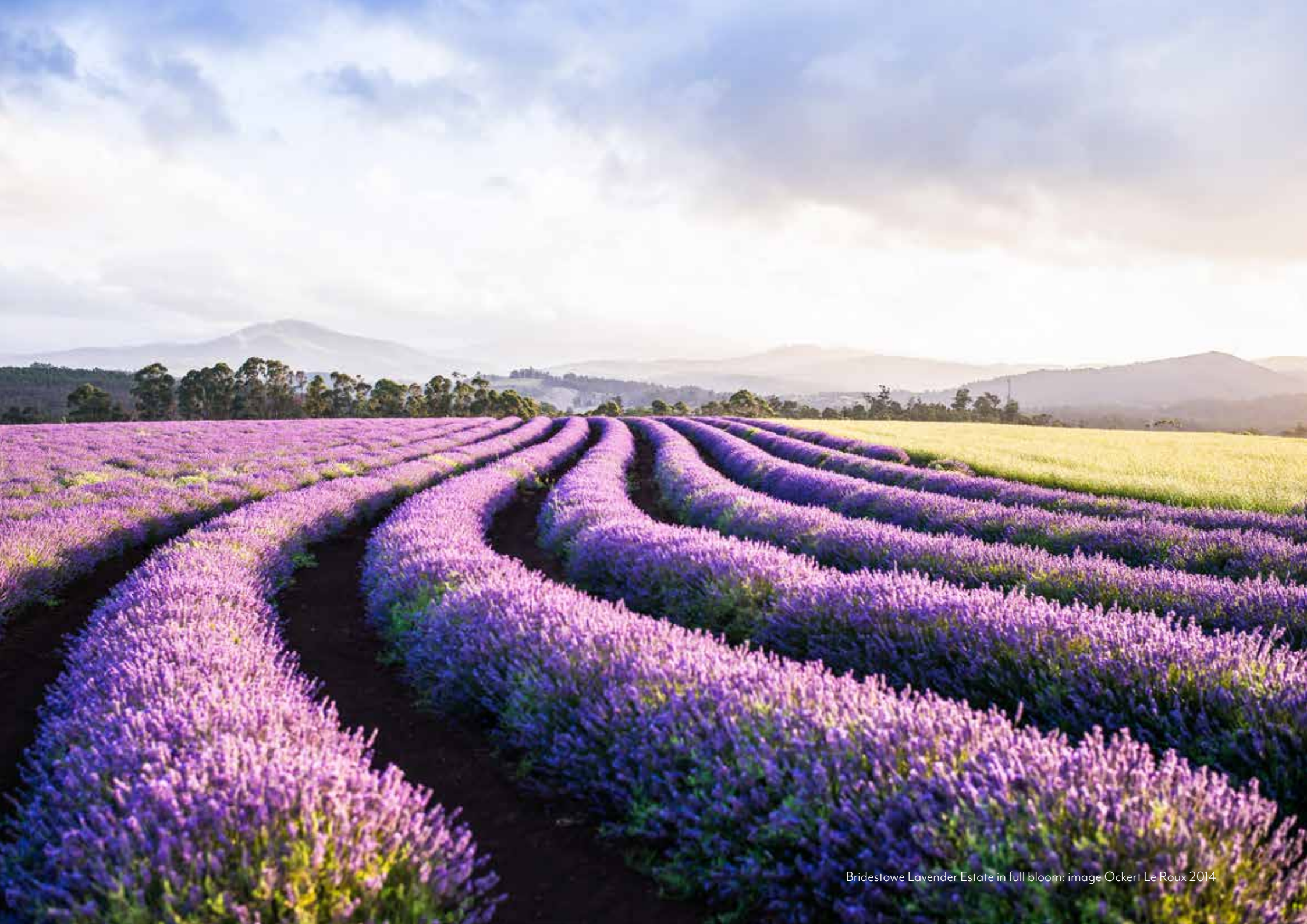
Bridestowe Lavender Estate in full bloom