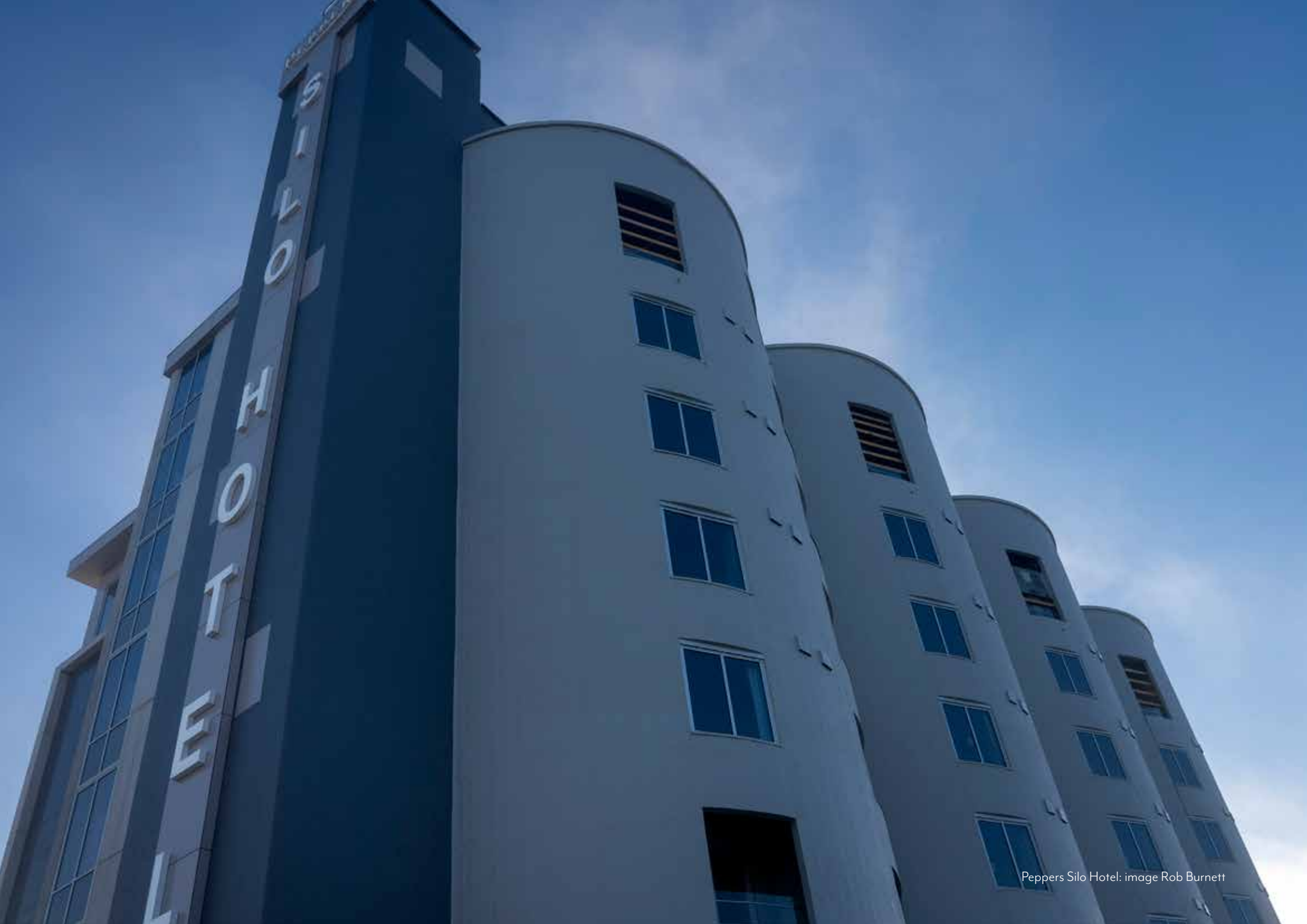
Peppers Silo Hotel: image Rob Burnett