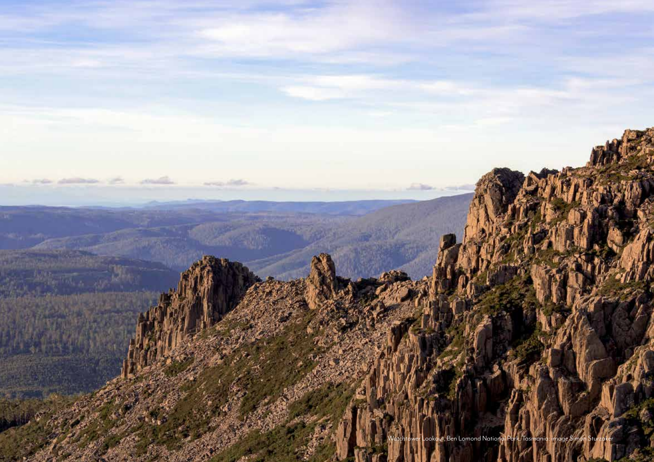
Watchtower Lookout, Ben Lomond National Park, Tasmania