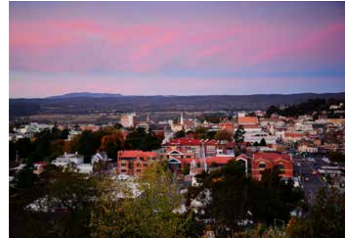
Launceston CBD at Sunset: image courtesy Tourism Tasmania and Brian Dullaghan