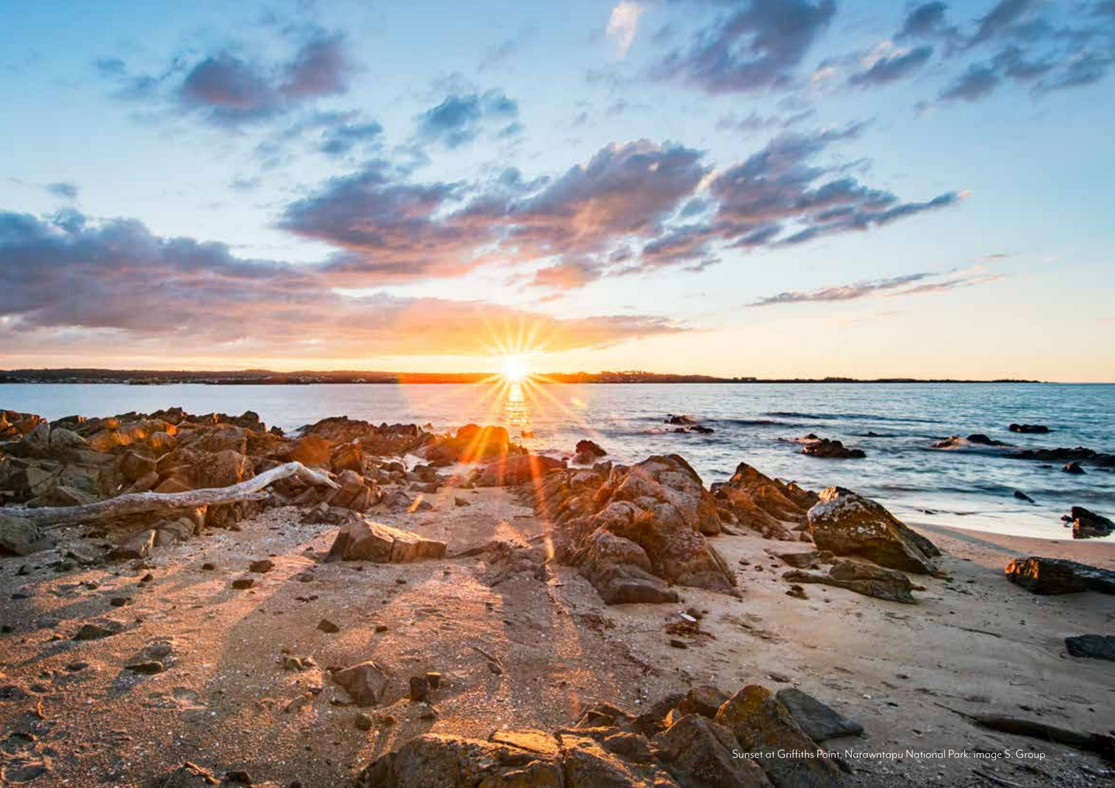
Sunset at Griffiths Point, Narawntapu National Park